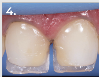
4. The deep dentin layer was placed using the highly opaque FORMA composite A3D shade.