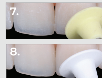
7. Jiffy™ polishing disks used for initial buff and polish.