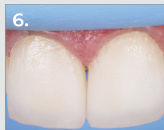
6. Enamel bleach shade XWE.