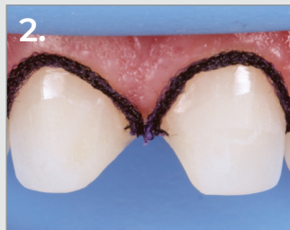
2. After removing the previous restoration, a modified isolation with a rubber dam and cords was done.