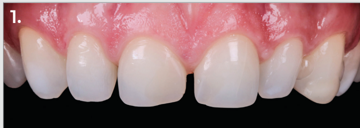
1. The patient desired to close the diastema between the central incisors and make some shape improvements to the incisors and canines.