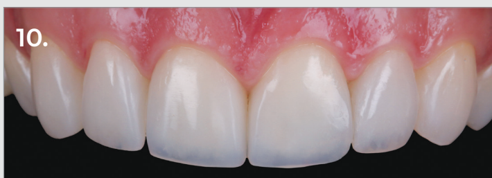
10. Final Result.