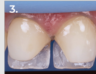
3. The palatal shell was reproduced using a silicone wall and the FORMA composite Incisal shade.