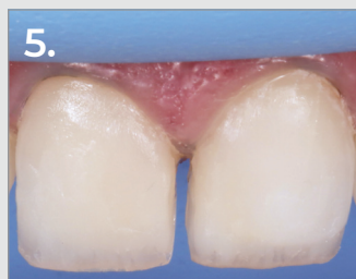
5. Entire superficial dentin and bevel area covered with FORMA composite A1B shade.